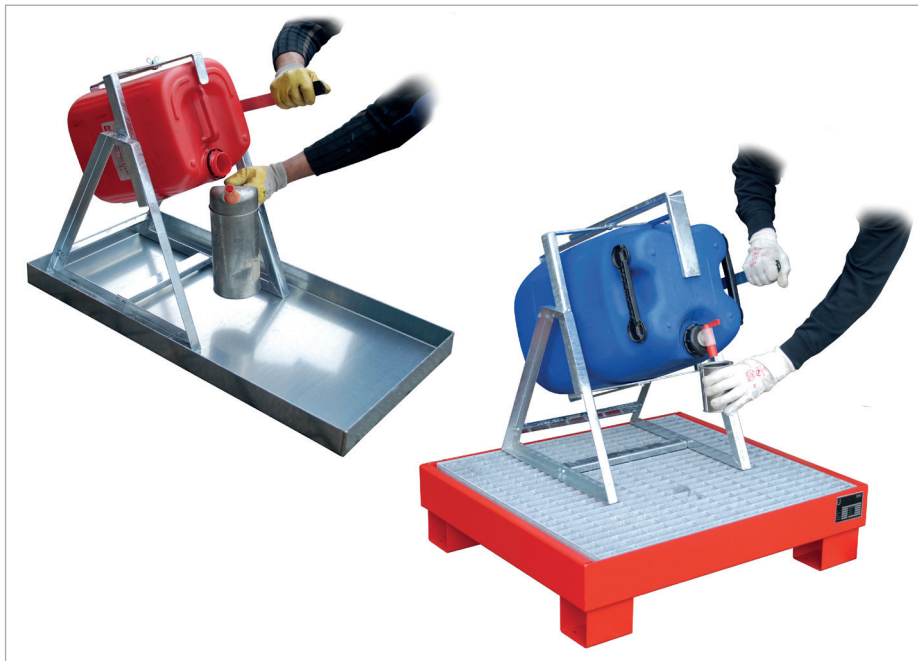
KAH-25 with Spill Tray for Small Cans KGW-2