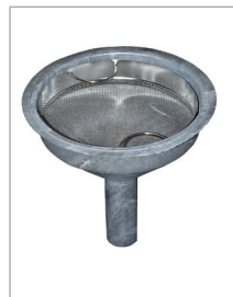
Funnel with stainless steel sieve