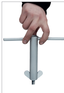
Wing nut wrench