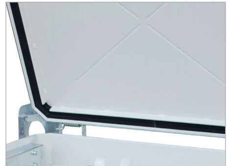
Spring-loaded lid with a seal