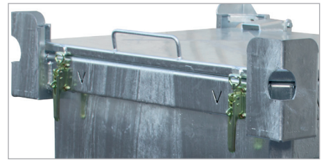
Stacking corners with crane lifting eyes