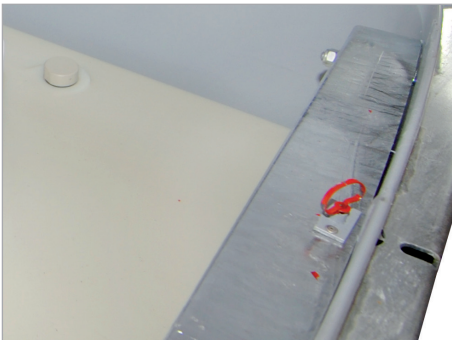
Dipstick to register any leakage