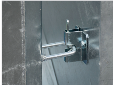
Automatic lid lock