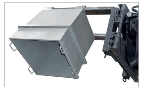
Emptying using a forklift rotator