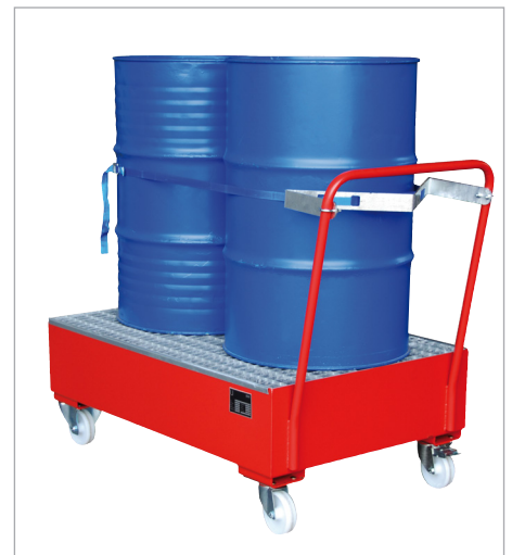
Tension Belt for 2x200 litre drums