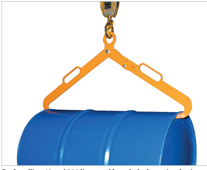
For handling 60 and 200 litre steel bunghole drums in a horizontal position