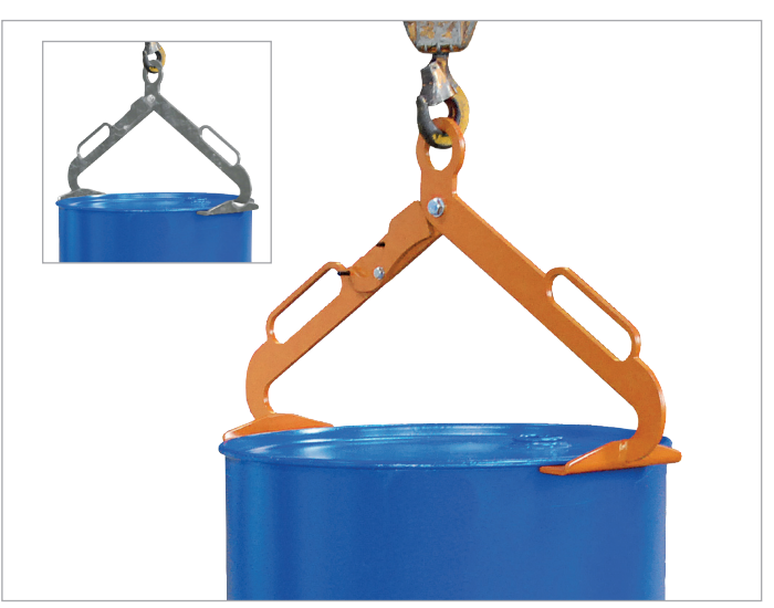
For handling 60 and 200 litre steel bunghole drums in an upright position