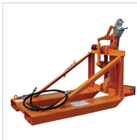
RS-I/91 with hydraulic grip lock