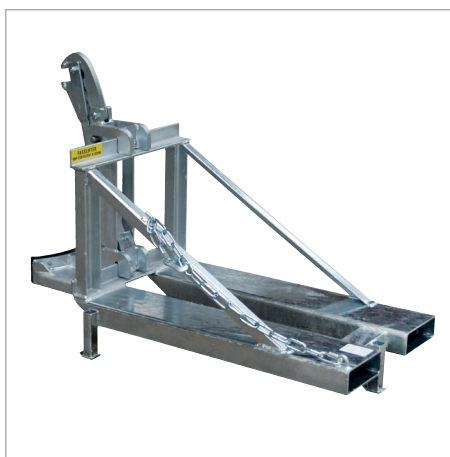
RS-I/M with supporting feet for straddle stackers