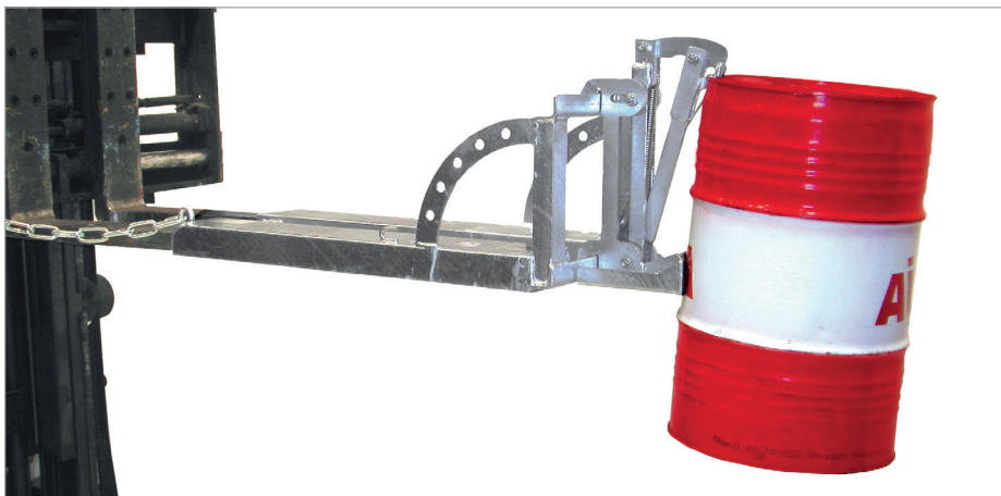
RS 60-I, suitable for drums with a min. height of 500 mm and with a top rim

The drum lifter to use for filled 60 litre steel bunnage drums