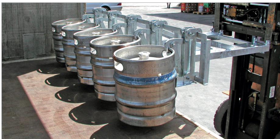
Special constructions available too: e.g. for 30/50 liter beer kegs