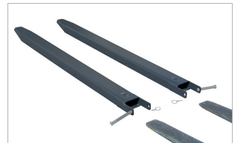
Secured by bolt