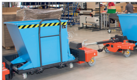
GU-RZ on a tugger train