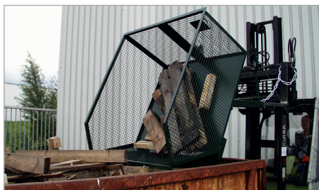
Individual construction: Lattice container GU-G