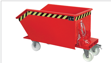
GU with castors