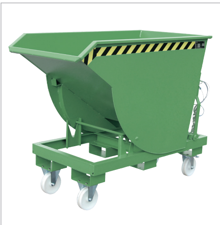
BKM with castors