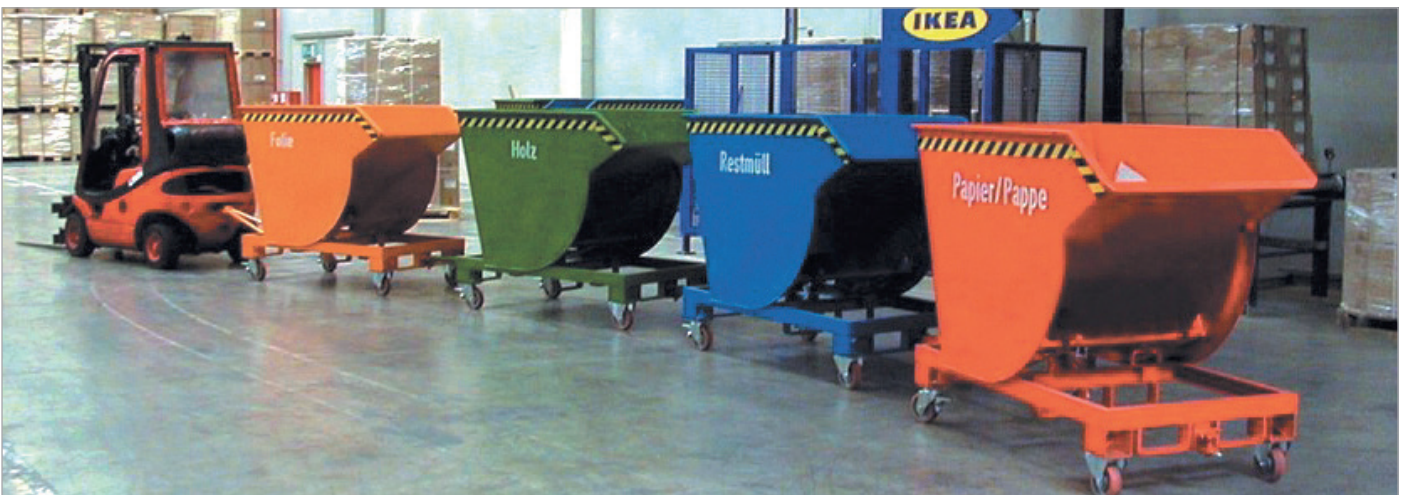
BKM with castors, trailer coupling and towing bar