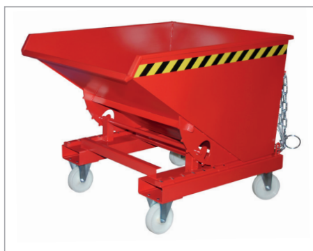
EXPO with castors