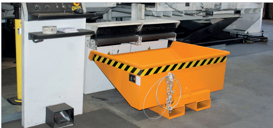
EXPO 150-275: ideal for use under machines as the dumping edge is only 445 mm high