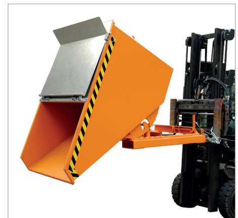
EXPO with lid