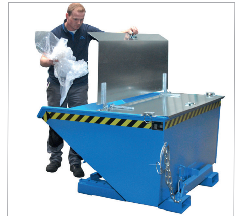
EXPO with lid