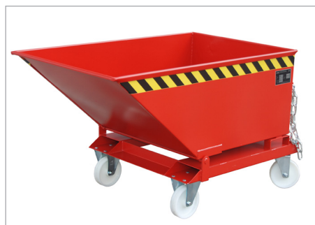
KN with castors (polyamide)