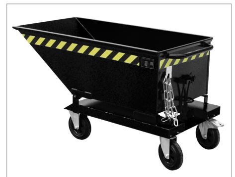
KN with castors (solid rubber)