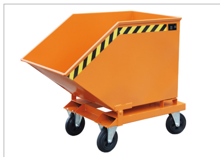
KN with castors (solid rubber)