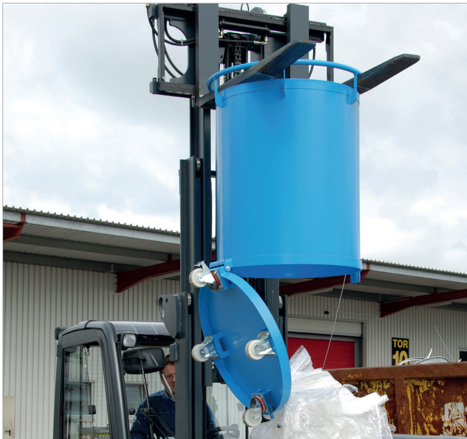
RB with castors