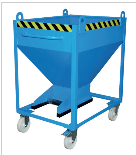
SR-D with crane eyes