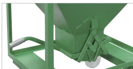
Special manually operated scissor lock (SR, SG, SRE)