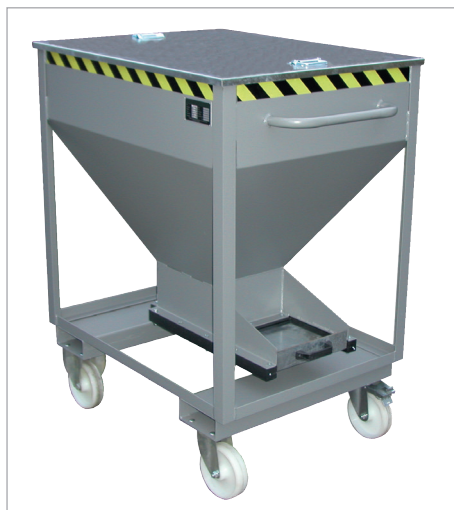
SRE-D with lid