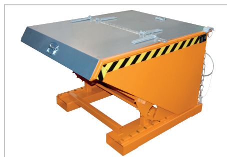
EXPO-E with lid