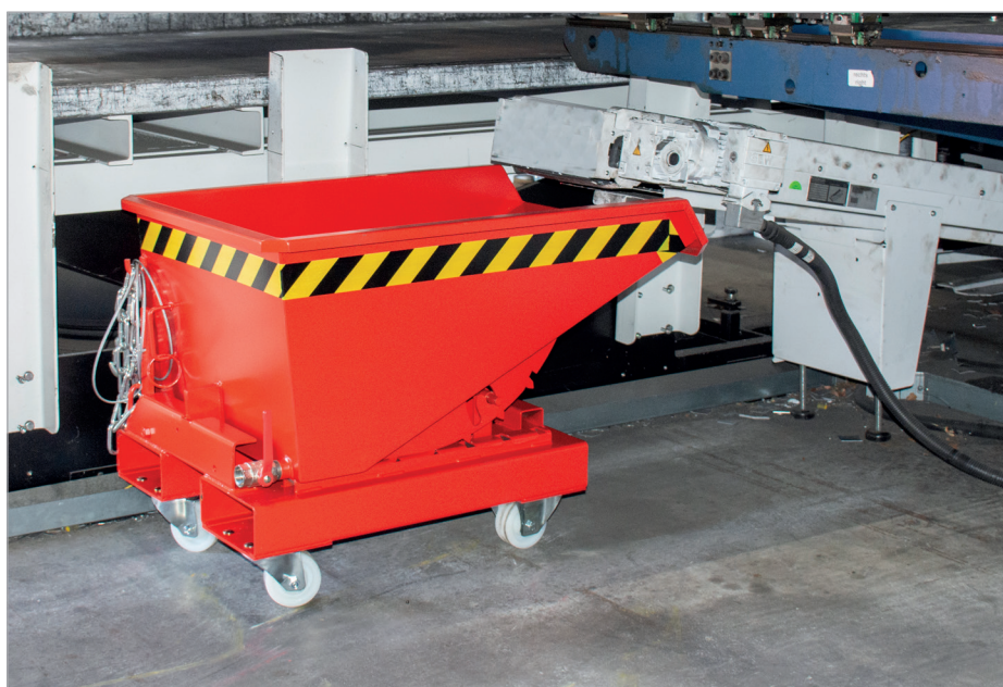
EXPO-E with castors