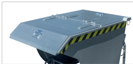
SKM with lid