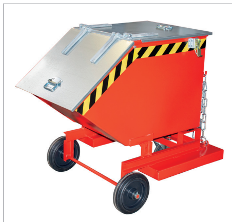
KW-ET with lid