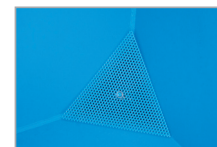
Perforated corner sieve