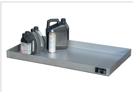
KGW 3 V4A