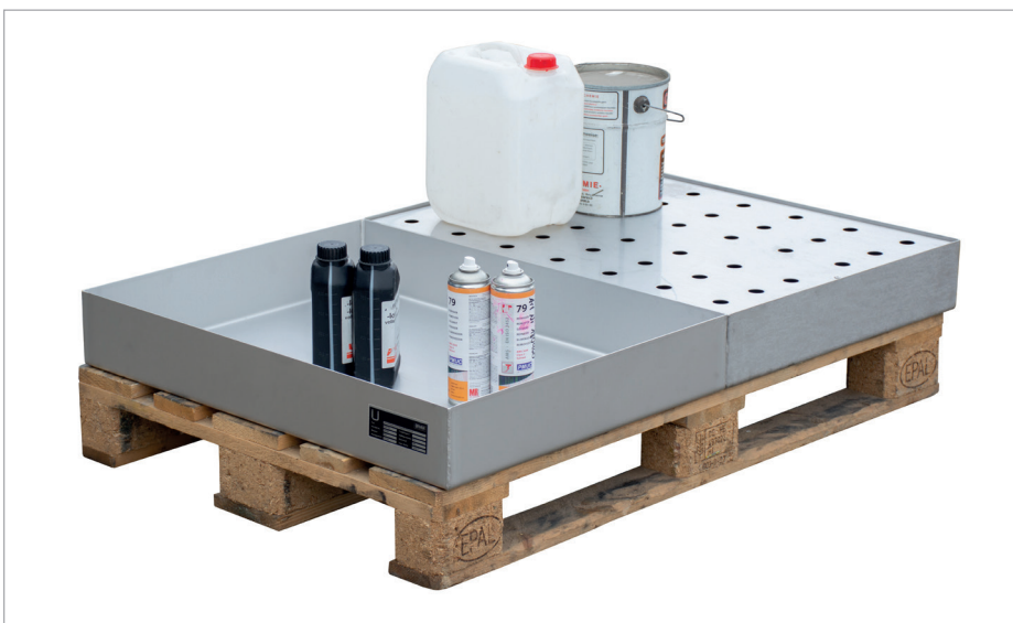
On a Euro pallet 1200x800 mm: KGW-P 2 V4A and KGW-P 2/M V4A