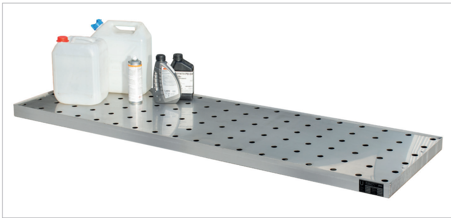
KGW 5/M V4A