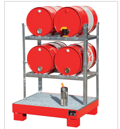
AW 60-2 + GR 60-2 + 2xAG 60-2 + 4xFA 60-A