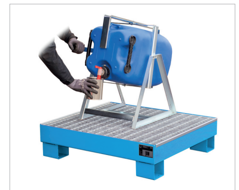
Tilting Canister Stand KAH 60 with Sump Tray AW 60-2/M