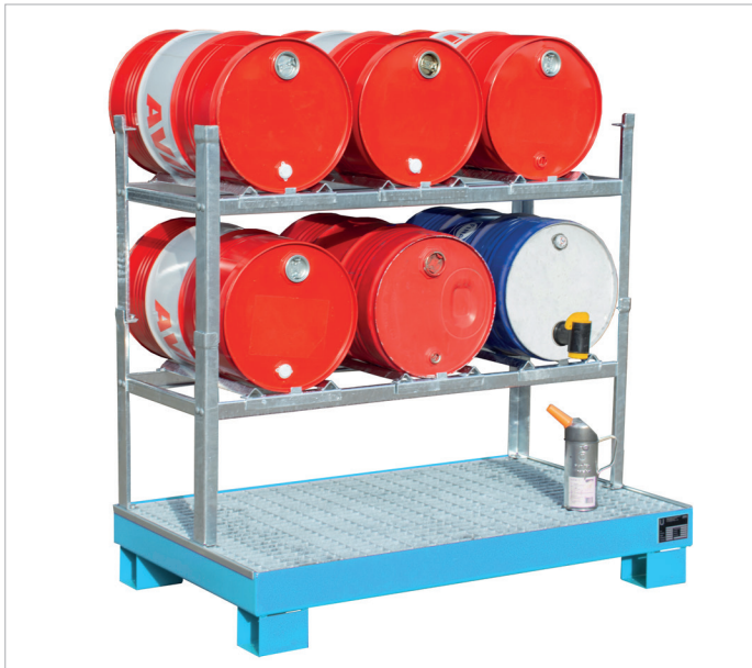
AW 60-3 + GR 60-3 + 2xAG 60-3 + 6xFA 60-A