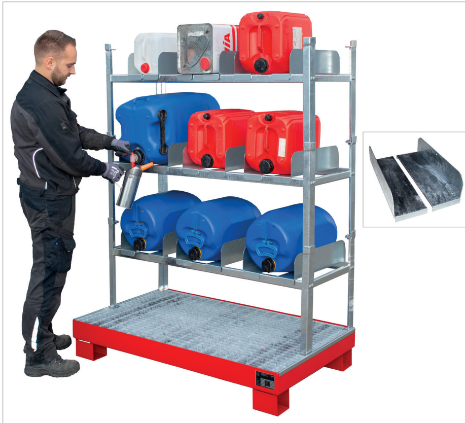
AW 60-3 + GR 60-3 + 3xAG 60-3 + 18xAB