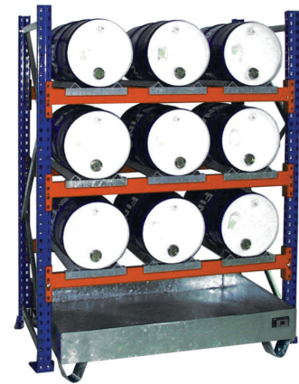
Basic shelf 3004