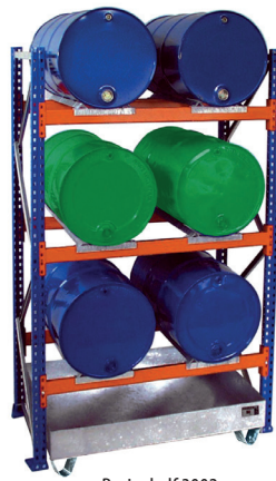
Basic shelf 3002