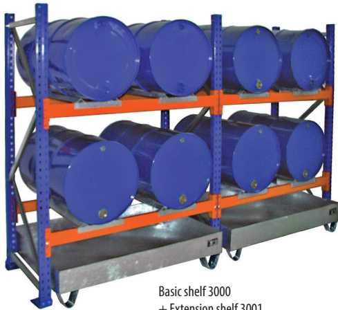
Basic shelf 3000 + Extension shelf 3001