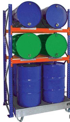
Basic shelf 3010