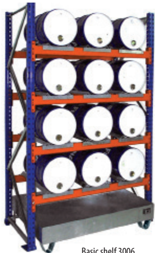
Basic shelf 3006