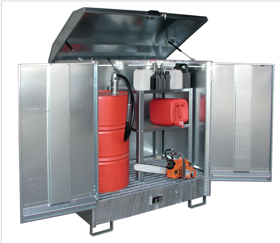
GD-N 2 with GR-A

Storage of max. 4 x 200 litre drums or 200 l drums in combination with 60 litre drums and/or canisters and small cans