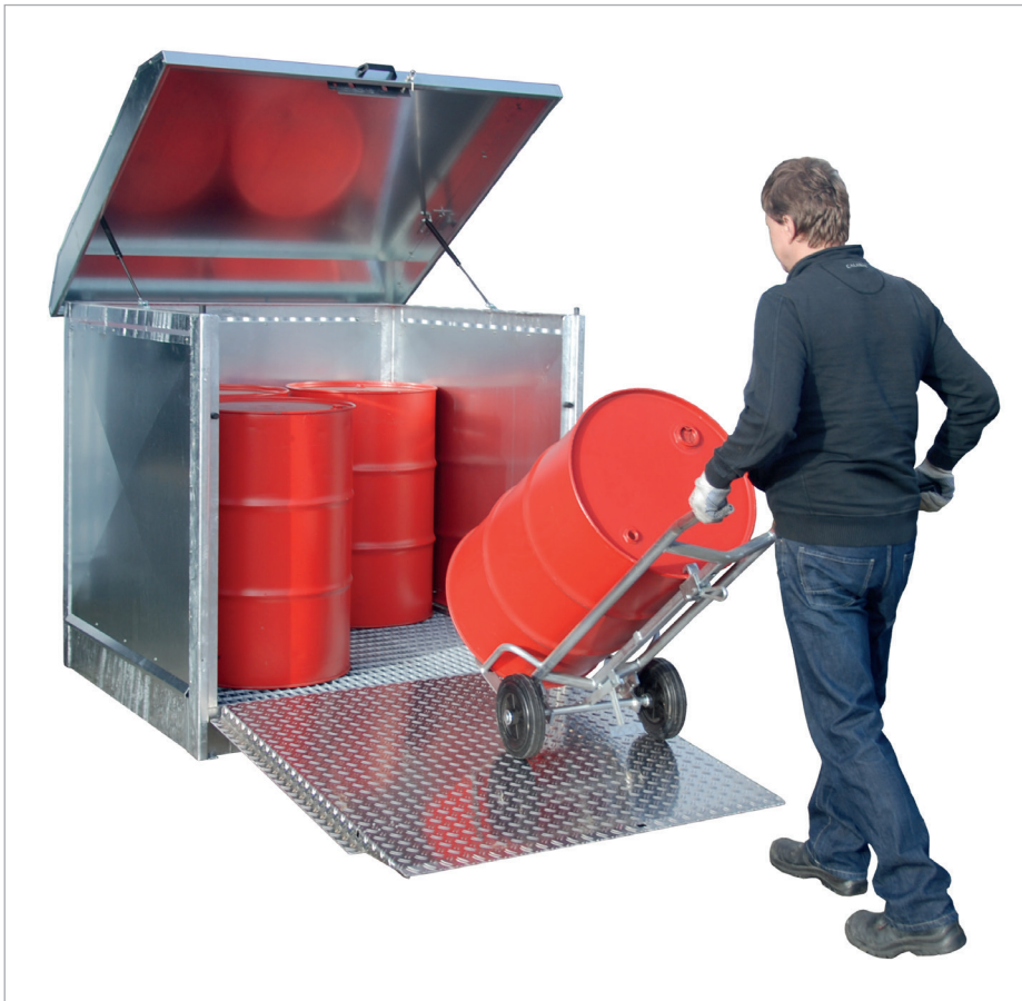
GD-N/R 4 und Drumskarre FP-V