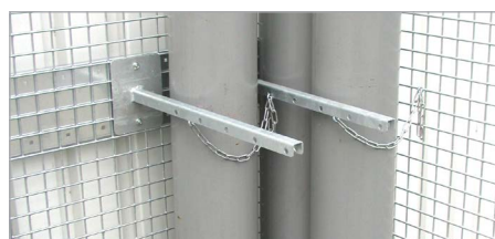
Fixture with safety chain