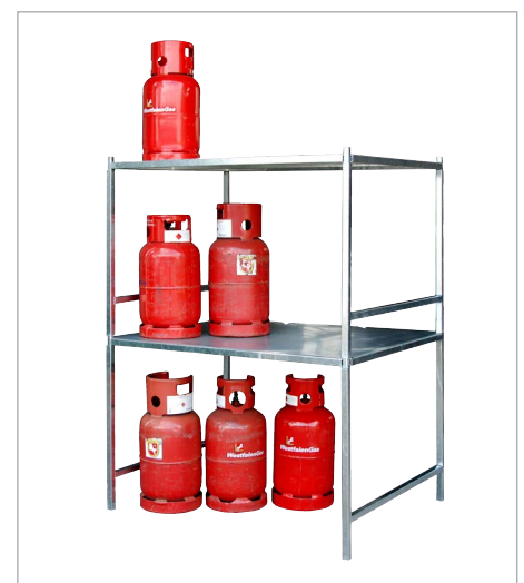
2x type GFG, stacked