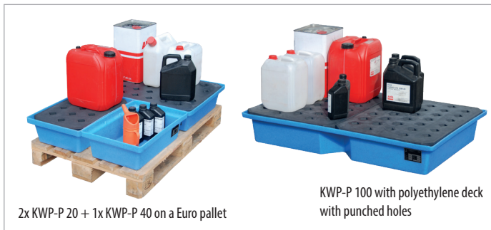
2x KWP-P 20 + 1x KWP-P 40 on a Euro pallet