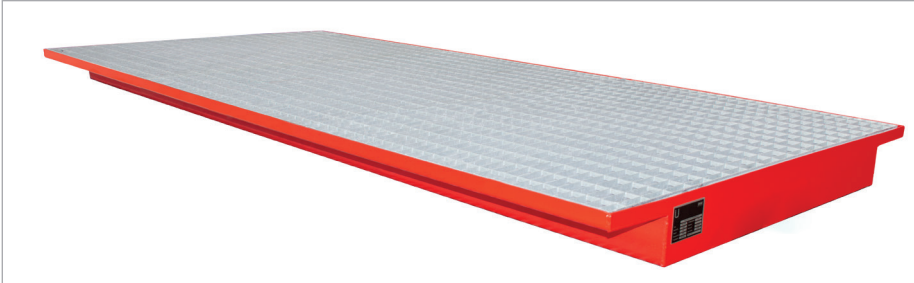
Suspended Sump Type EHW 2700