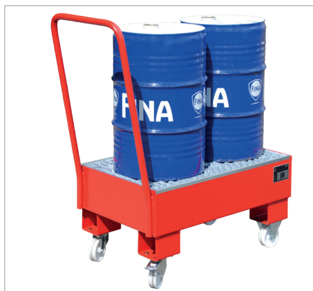
AW 60-1 SR