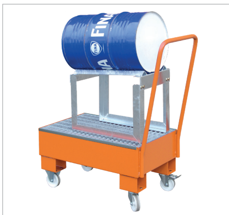
AW 60-1 SRF