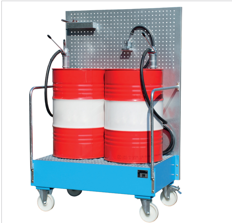
LPW 200-2 with tool deposit and drip tray (accessories)

Dispense oils etc. from 200 litre drums, wherever necessary - mobile, safe, simple