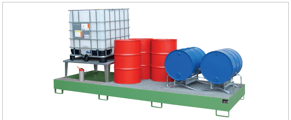
AWA 31 + FP-2