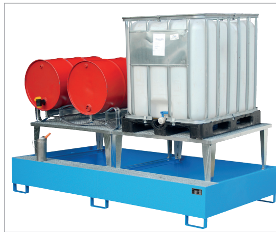
AWA 1000-2 + FP-2

Storage of max. 3 x 1000 litre containers (IBCs) or IBCs in combination with 60/200 litre drums and/or canisters and small cans