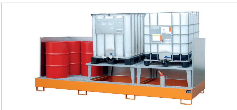
AWA 32/SW (with splash protection wall)