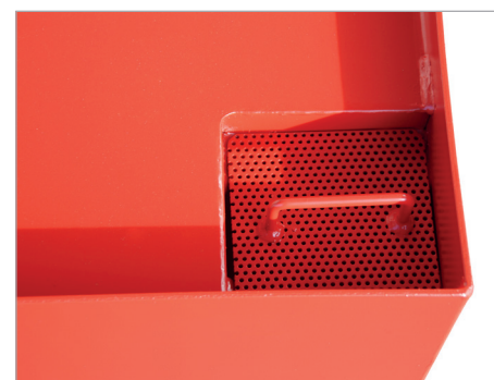
Suction opening and level indicator