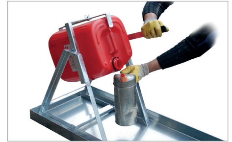
KGW 2 with Tilting Canister Stand type KAH-25 (see page 116)