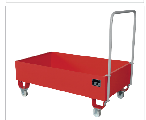
Sump tray with Element No. 2