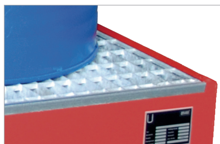
Element No. 1