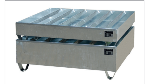
PWE 200-4 and 400-4 stacked